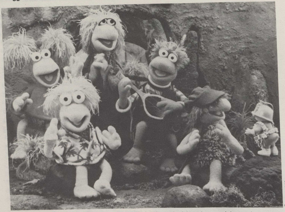
Characters from Fraggle Rock, the new Canadian television show, celebrate the news of winning an international Emmy award for the Canadian Broadcasting Corporation.

Fraggle Rock captures international Emmy award