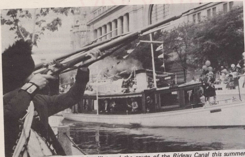
The steamship Phoebe, which will travel the route of the Rideau Canal this summer, leads the flotilla at the Rideau Canal opening in Ottawa.