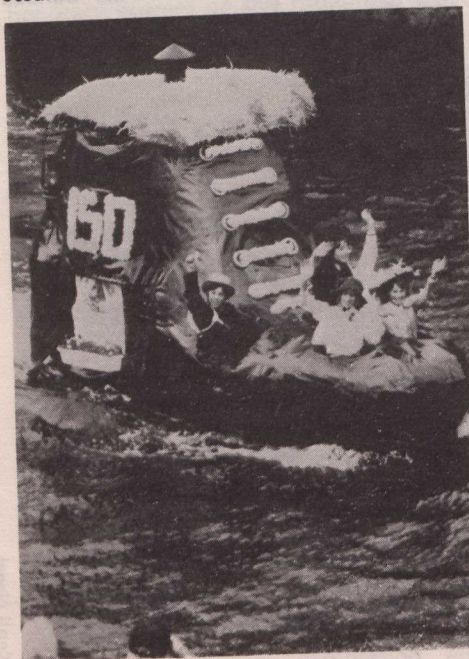
One of the festive boats in the flotilla.

The steamers making the city-to-city excursion will average 12 metres in length. Parks Canada is sponsoring the event and the Canadian Coastguard will provide a barge stocked with hardwood to fuel the steamers. Several boats are decorated in