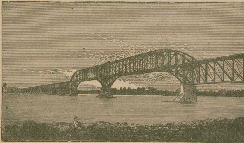
ST. LAWRENCE RIVER BRIDGE, CANADIAN PACIFIC RAILWAY, LACHINE, P. Q.

For Railways and Highways, Iron Bridges, Turntables Iron Piers and Trestles Bridge Rods Right and Left Hand Sleeve Nuts and all kinds of Structural Iron Work.