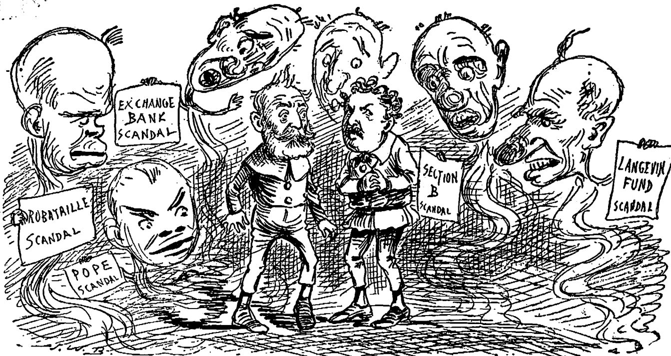
MASTERS BOWELL AND COSTIGAN LEFT IN CHARGE OF THE HAUNTED HOUSE.

man have cause to stumble because of another man's laziness or neglect; it therefore behooveth ye ministers and elders of every kirk session to at once lay hold with a firme hand of ye spade of duty, and each session clear off its own steppes—in other wordes, to immediately summon before ye session all members of each kirk who are connected with politics or ye government of ye countrie. And in order that they may be brought to unfeigned repentance of their misdeeds, and that no enemy of ye kirk shall be able to point ye finger of scorn and say ha! ha! they preach much but practice naught; these erring members shall stand on the cuttie stool of repentance, and be rebuked by ye minister before ye elders of ye session and ye congregation according to ye ancient and venerable custome of ye Presbyterian kirk in ye olden time. So shall ye kirk be purged of ye sin of politics and worldlie statesmanship. Ye distinct and outspoken declaration of ye late Assemblie hath left ye Presbyterian kirk no other choice but either to at once proceed to deal with their own individual members, and so purge themselves of this crying iniquity—or have such declaration spoken of by worldlie men—as a mere professional protest “full of sound and fury, signifying nothing.”