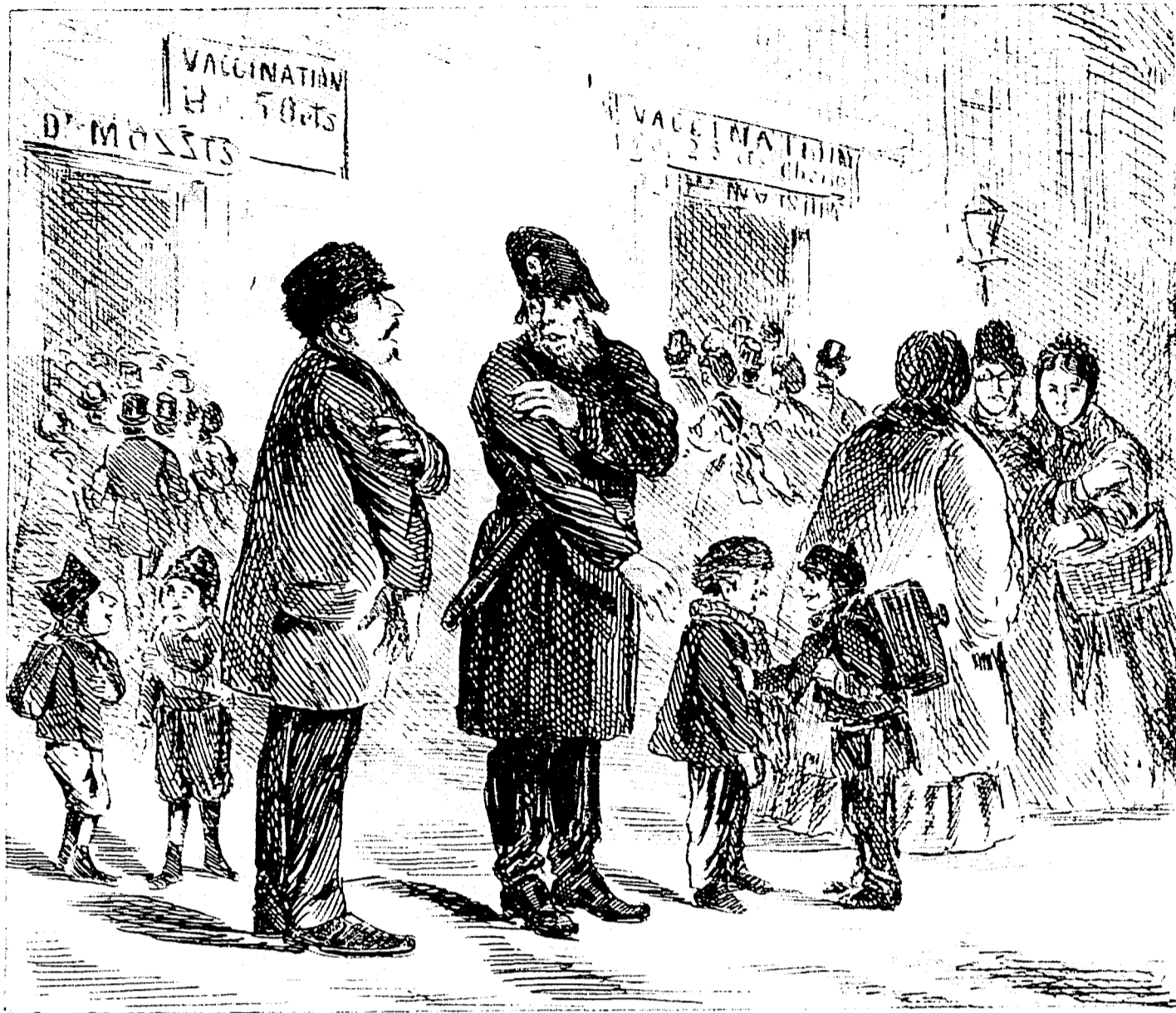
Did it take?

ABAYLIS.—CARPETS, FLOOR CLOTHS, CURTAINS, &c. NOTRE DAME ST., EAST OF MCGILL