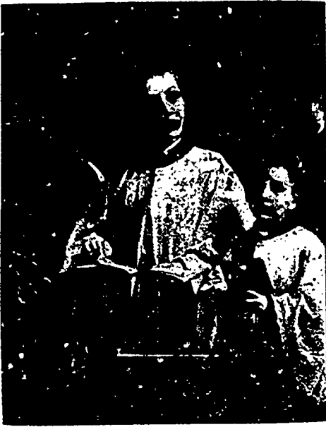
A CHURCH OF ENGLAND SONG.