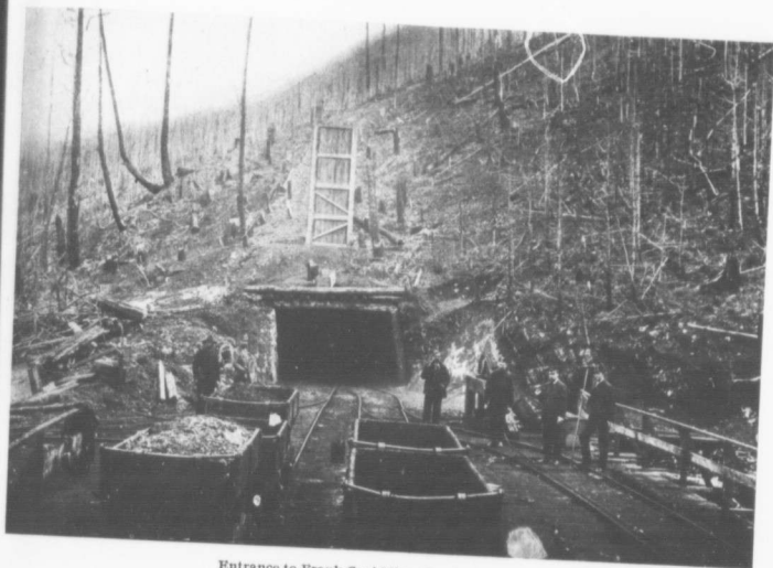
Entrance to Frank Coal Mine, Frank, Alberta.