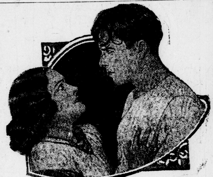
GLORIA SWANSON COMING TO LOEW'S.

Gloria Swanson and Ben Lyon in "Wages of Virtue," a romance of the French Foreign Legion, at Loew's on Thursday, Friday and Saturday of next week.