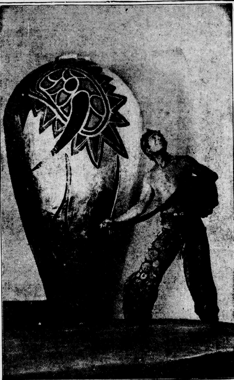
SCENE FROM "THE THIEF OF BAGDAD"

The "Thief of Bagdad" will be shown on Monday evening at 8:15 and twice daily on Tuesday and Wednesday at 2:15 and 8:15.