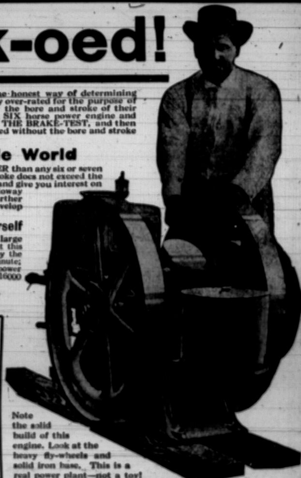
Note the solid build of this engine. Look at the heavy fly-wheels and solid iron base. This is a real power plant—not a toy!