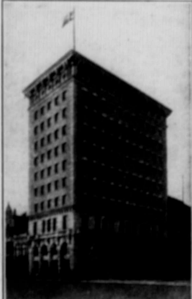
Head Office, Winnipeg

SASKATCHEWAN —Adams, Alask, Assiniboia, Assinibois, Buchanan, Cabri, Canora, Carlyle, Craik, Cupar, Cut Knife, Esterhazy, Eyebrow, Fillmore, Gravelbourg, Gull Lake, Herbert, Humboldt, Indian Head, Jansen, Kindersley, Kerr Robert, Landon, Lang, Langdon, Lemberg, Lumsden, Love Land, Macklin, Maple Creek, Maryfield, Milestone, Moose Jaw, Mouson, Nether Hill, Neudorf, Ogema, Outlook, Oxbow, Pense, Perdue, Plenty, Qu'Appelle, Regina, Rocanville, Rosetown, Saskatoon, Scott, Strasbourg, Swift Current, Simpson, Sisseton, Southey, Tessier, Theodore Togo, Tompkins, Vanguard, Viceroy, Wapella, Watrous, Welch, Weyburn, Wilkie, Windhorst, Winkler, Yorkton, Zeelandia ALBERTA —Airdrie, Alt, Barons, Bashaw, Bassano, Bellevue, Blackie, Blairmore, Bowden, Bow Island, Brooks, Calgary, Carbon, Cardston, Carlstadt, Carstairs, Claresholm, Cochrane, Consort, Cowley, Didsbury, Edmonton, Fort Saskatchewan, Grande Prairie, Grassy Lake, High River, Hillcrest, Innisfail, Irvine, Lacombe, Langdon, Lethbridge, Macleod, Medicine Hat, Okotoks, Ponburg, Pincher Creek, Seven Persons, Strathmore, Swallow, Three Hills, Wainwright