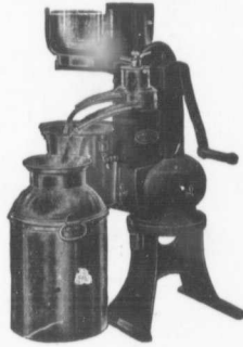
The favorite everywhere they go. Note its beauty and heavy compact construction, with low-down, handy supply can only 3 1/2 ft. from the floor.

as to what make of Separator you are going to install?