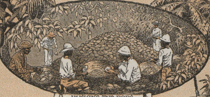
HUSKING THE PODS

The technical name for Cocoa is 'Theo Broma' which means 'Food of The Gods'