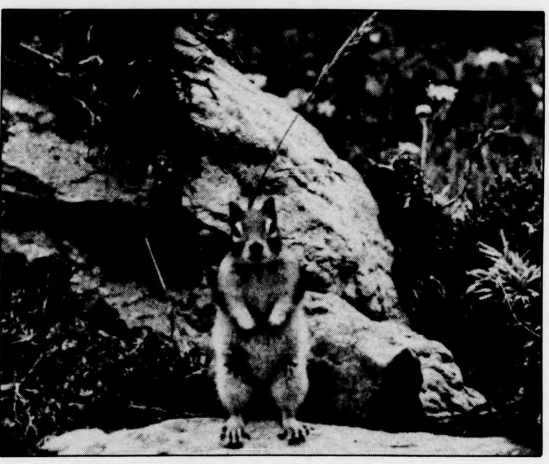
"This is where I stand," the chipmunk said. "On a rock . . . in a forest . . . talking to a bunch of trees. My platform is hard, but I like to think it's fair." The trees, conservative as any species in the forest. rustled their leaves in approval. Unfortunately, no proxies are allowed, so how they will get to the Excalibur office to vote must remain one of nature's mysteries.