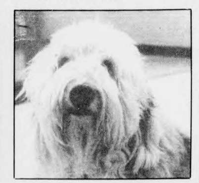
DOG Political Science (Independent Studies)

but you would be too if your best friend was man!