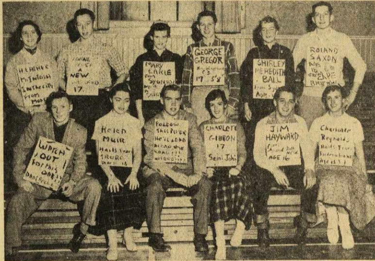
Shown in the above photo are some of this year's crop of frosh. They are obviously enjoying one of the most exciting moments of Dal's new initiation programs.