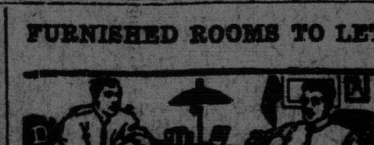
FURNISHED ROOMS TO LET

GIRL WANTED—Apply General Public Hospital. 26716-4-29