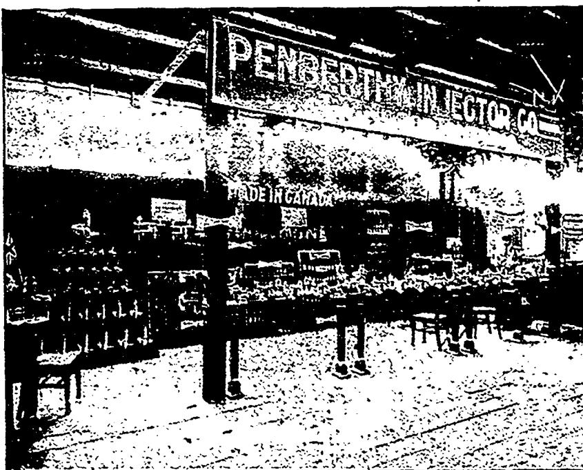
DOMINION EXHIBITION, WINNIPEG—EXHIBIT OF PENBERTHY INJECTOR COMPANY.

The E. Long Mfg. Company, of Orillia, Ont., had on exhibit in the Machinery Building a creditable display of various machines, noticeable among which were their Clipper shingle machines, Lockport swing saw mills, a three saw double edge lathe and picket