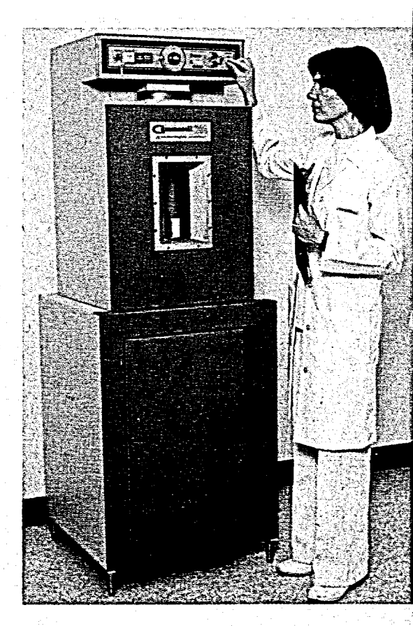
The gamma cell 1000 blood irradiator produced by AECL Radiochemical Company, Industrial Irradiation Division, is designed for safety and reliability in service.

The Industrial Irradiation Division of the AECL Radiochemical Company, a subsidiary of Atomic Energy of Canada Ltd., has designed and manufactured commercial gamma processing equipment, research and clinical irradiators and cobalt 60 sources for industry since 1957. It is the