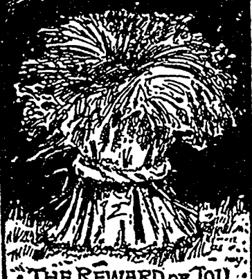
THE REWARD OF TOIL

SEMI-MONTHLY MAGAZINE * DEVOTED TO THE * FARM AND GARDEN · STOCK · POULTRY · * * · ORCHARD · APIARY · * * * GRANGE · DAIRY · HOME-CIRCLE ·