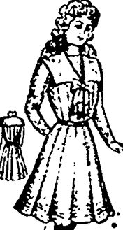
799 - GIRLS' TUCKED BLOUSE. COX-TUME. 4, 6, 8, 10 and 12 years. Attractive costumes in the mode of serge, henrietta, cashmere, crepe or flannel, are combined with cloth of contrasting shades, or they may be made of one color and trimmed with narrow braid, velvet ribbon or cimp in place of the machine stitching.