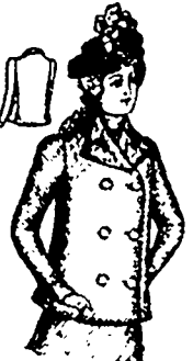
793 - MISSES' BOX REEFER. 12, 14 and 16 years. Made of broad or ladies' cloth, coat of any of the new medium weight cloakings are appropriate for wearers in this style.