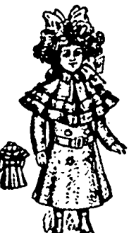
794 - CHILD'S COAT WITH TRIPLE CAPE. 2, 4, 6 and 8 years. Made of light cloth, covert, poplin, chertot or light-weight double-face cloth are appropriate materials for this mode, with trimmings of ribbon, fancy braid or narrow applique. The coat may be lined throughout with bright silk or, if a lighter weight garment is desired, lining may be used in the cape only.