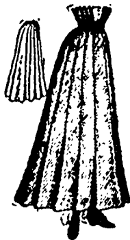
790 - MISSES' PLAITED SKIRT. 12, 14 and 16 years. A fashionable skirt in Russian green light weight cloth, shaped with a graceful front, and a graceful, box-plaited back. The plaits are backward turning, forming a single box plait in the center front. They are quite shallow at the belt and deepen toward the lower edge.