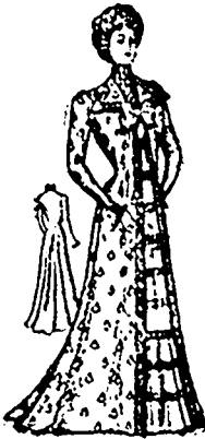
786 - LADIES' TEA GOWN. 32, 34, 36, 38, 40, 42 and 44 inch bust. Lovely gowns may be made in taffeta, India silk, foulard, cashmere, Venetian, poplin, crepe de chine or other light-weight fabrics, with trimmings of lace, ribbon, velvet and rich-ness of chiffon or mousseline de soie.