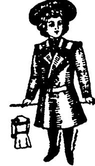
795 - BOYS' COAT WITH ADJUSTABLE SHIELD. 2 and 4 years. Made of white pique with trimmings of Hamburg insertion and embroidery. Pique is the appropriate material for the summer, but it may be stylishly developed in poplin, corded silk or velvet, for dressy wear, with trimmings of cream lace.