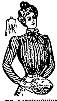
792 - LADIES' SHIRT WAIST WITH APPLIED BOX PLAITS IN BACK. 32, 34, 36, 38, 40 and 42 inch bust. The waist is appropriate for silk and cotton fabrics as well as for cashmere and fine plaid woolsens.