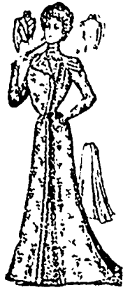
780 - LADIES' FANCY WAIST 782 - LADIES' PANEL SKIRT. Waist 32, 34, 36 and 40 inch bust. Skirt 22, 24, 26, 28 and 30 inch waist. Lovely gray satin foulard is attractively developed in a fancy waist and panel skirt, trimmed with white lace and insertion. The panel skirt is one of the latest Parisian novelties which bids fair to become popular this season.

Patterns should be ordered of the Office of this Publication. Full directions, quantity of material required and illustration of garment with each pattern.