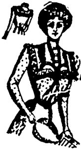
791 - LADIES' BLOUSE WAIST WITH SHIELD. 32, 34, 36, 38 and 40 inch bust. May be made up in summer fabrics, pique, madras, linen, lawn, cotton, chertot and mercerized cottons without lining. The shield can be buttoned under the sailor collar.