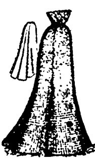
798 - LADIES' FIVE-GORED SKIRT WITH TWO BOX PLAITS IN BACK. 22, 24, 26, 28, 30 and 32 inch waist. This graceful, five-gored skirt model is particularly appropriate for cloth or tailor-made gowns. Although some of the new silks are silk and box-plaited, many prominent ladies' tailors prefer the gored skirts with the box-plaited backs. Homespun, chertot, Venetian, ladies' cloth and covert are appropriate materials for skirts in this mode.