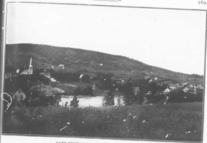
CAPE BRETON ISLAND—The village of Mabou.