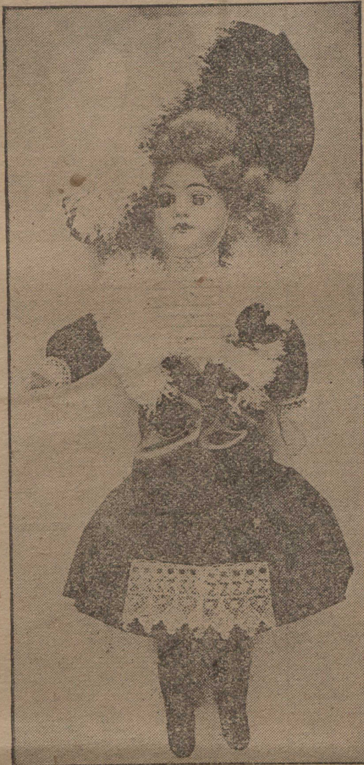
Card to-day, and this beautiful dolly will be your very own in a few days. We don't want one cent of your money and we allow you to keep out money to pay your postage. THE COLONIAL ART CO., Dept. 437, Toronto.