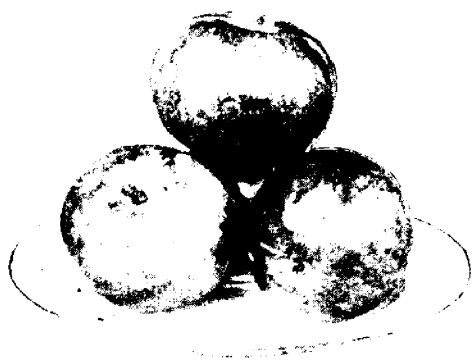
FIG. 822.—PLATE OF ASTRACHANS.

The basket used is a very neat one, with board ends, on which is stamped the name of the grower and the grade of the fruit. The quantity contained is about a peck and a half, and when only the most fancy fruit is thus packed, they will always sell. The ventilated barrel is used for ordinary grades of summer apples, and two or three of these are shown in the back ground in Fig. 823.