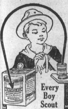
Every Boy Scout