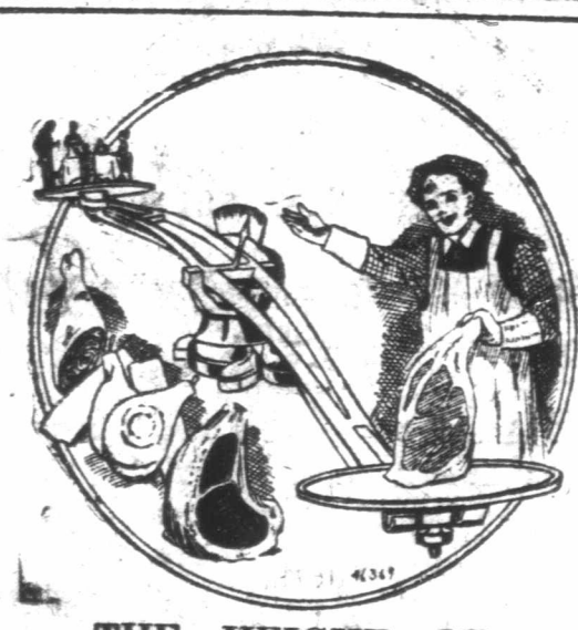
THE HEIGHT OF SATISFACTION

is reached at our market. You get the best of Meats, the right cuts