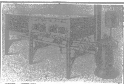
Four Compartment, 1,200 Egg Size Candee

WHEN you think of the hatching that has to be done with small machines and broody hens, you will realize the field for a CENTRAL CUSTOM HATCHERY