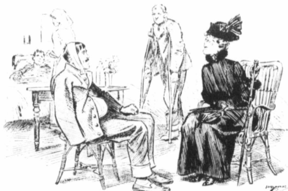
How to Talk to the Wounded