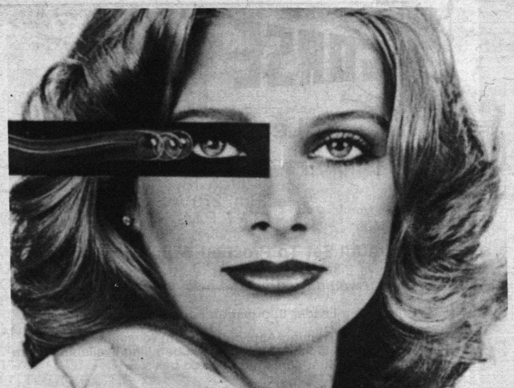
Yes, the modern way of correcting vision can be yours at an amazingly low price.

Save now, get that pair of soft contact lenses you've always wanted!