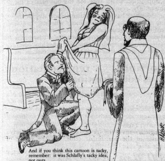
And if you think this cartoon is tacky, remember: it was Schlafly's tacky idea, not ours.

News Item: Phyllis Schlafly says the answer to herpes is to marry only virgins. (And how does one verify male virginity anyway?)