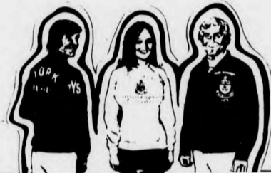
Hundreds of Poplin, Nylon, Leather, Melton, Corduroy Jackets, Slacks & Sweats & T Shirts.

ATLANTIC, Dept. CY1, 45 Mayesbrook Road, Dagenham Essex, RM8 2EA, England.