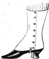
Ladies' 7 Button Jersey.