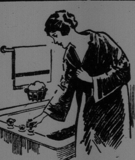
More Important to Internal Cleanliness