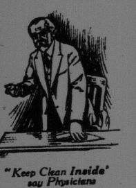
"Keep Clean Inside" says Physicians

Physicians Advise Lubrication for Internal Cleanliness. Medical science, through knowledge of the intestinal tract gained by X-ray ob-