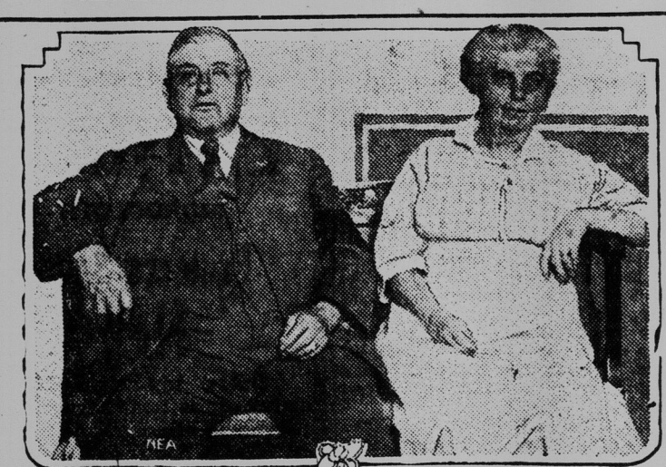
divorced. Each married and a few years ago the second mate of each one died. Now, lonely in their old age, they have remarried and are