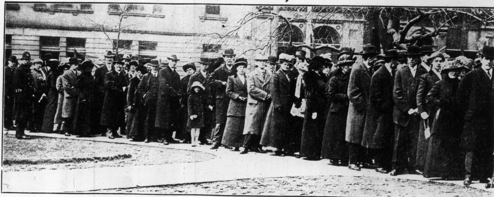
THE EASTER SUNDAY PARADE AT OLD ST. JAMES' CHURCH.