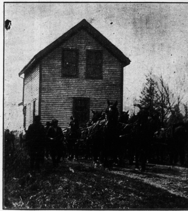
ONE PHASE OF THE SPRING BUILDING MOVEMENT. HORSES HURRYING A MIMICO HOME TO A NEW LOCATION. THE HOUSEHOLD GOODS OF THE OWNER WERE NOT DISTURBED. HE AND HIS FAMILY WALKED BEHIND THEIR HOME AND RESUMED HOUSEKEEPING AT THEIR NEW ADDRESS.

Extravagantly large sizes in writing paper sheets and envelopes are the latest things in stationery. Double sheets that fold once before fitting into envelopes of eight by four-inch dimensions are not considered extraordinary, and mere correspondence cards are nearly as wide and as long. Both these extreme sizes—according to the ones in use a few years ago—come in the fashionable blue and mauve tints and have envelopes lined with deep purple tissue or in shirt-waist patterns as they are called.