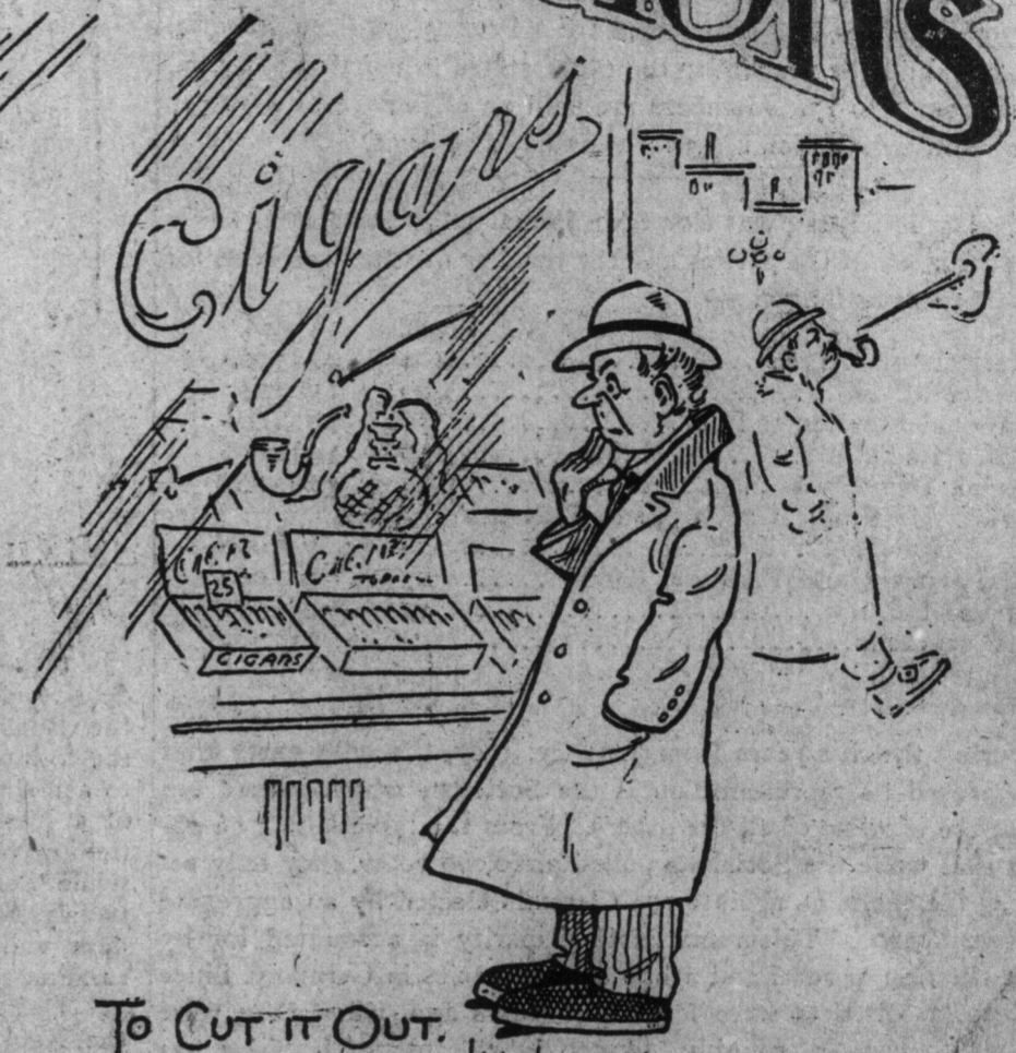
TO CUT IT OUT.