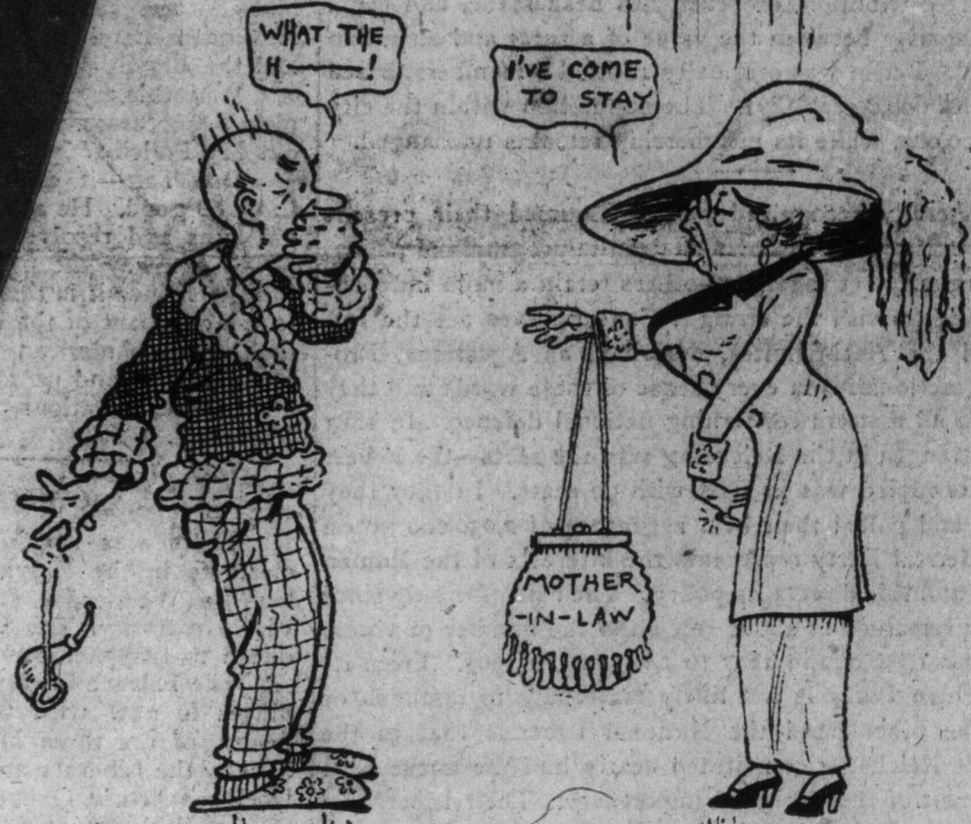
NOT TO USE BAD LANGUAGE