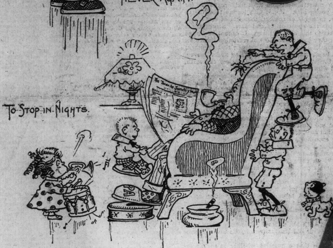
TO STOP IN NIGHTS.