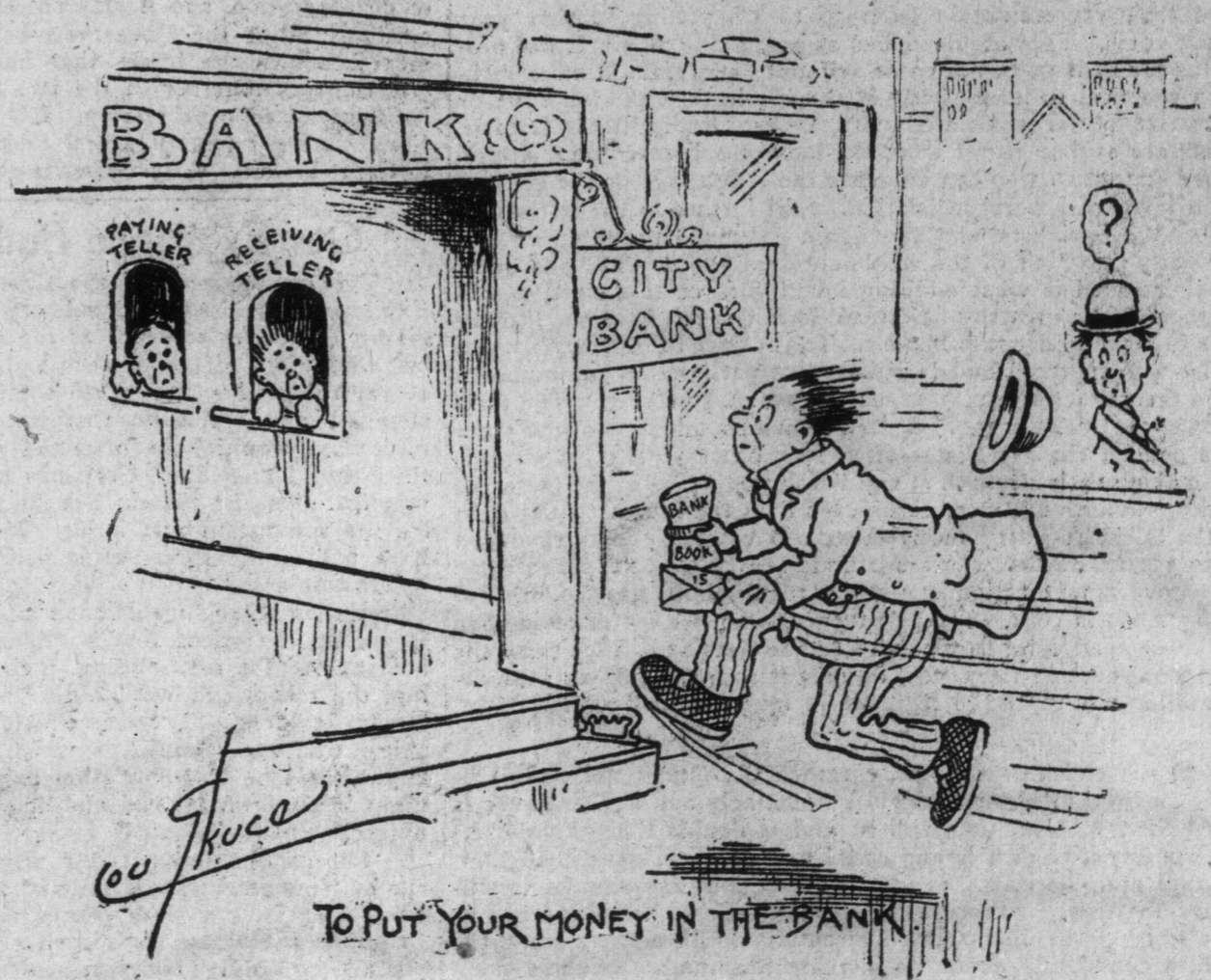
TO PUT YOUR MONEY IN THE BANK.

PERSON store Prices Mark Day in n's Section ne and fashion- for Men, in the ns, greys and d fancy tweeds, ngle-breasted, 3- e, perfect fitting, ailored, all-wool ngs. Regularly 12.50, $14.00. ... 7.45 SHEEP-LINED OAT: d of coat for her will be on y morning; it is heavy brown English cordu- with sheepskin; fasteners, fly- er-bound pock- arm shields and ollar. Regular- d $6.00. Mon- ... 4.95 g-Room ure and Unusual ices we show and we give have making this tre for those good quality, sed with large cket-book. A or Monday: in sold oak, 5 1 arm chair. Reg- nday ... 7.00 y, $22 and $22.75. ... 16.00 $25.00. Monday ... 18.75 in selected quar- early English or dental des'gn with arly $28.00. Mon- ... 21.50 Regularly $31.50. ... 21.00 y $23.00. Monday ... 17.50 ffets, quarter-cut ith leaded glass y space, large cup- drawers. Regular- y ... 53.00 Monday $2.00 arter-cut oak, a with lots of cup- space, and heavy Regularly $31. ... 23.50 ite, 10 pieces, in Sideboard, Ex- na Cabinet, Din- all Chairs and 1 gularly $234.50. ... 175.00 gn. Regularly ... 179.00 vares in English a floral decor- ... 2.99 dinner, soup, ... .30 nday ... .29 mprising .97 rich gold fir- ... 11.21 Regularly ... 25.00 e sizes. Re- ... 2.98