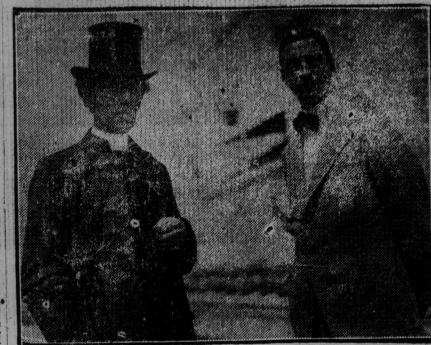
picture was taken on the deck of the Baltic in New York just before Archbishop Mannix sailed. It had been rumored that the 'president' of the Irish "republic" would sail also, but he stayed behind.