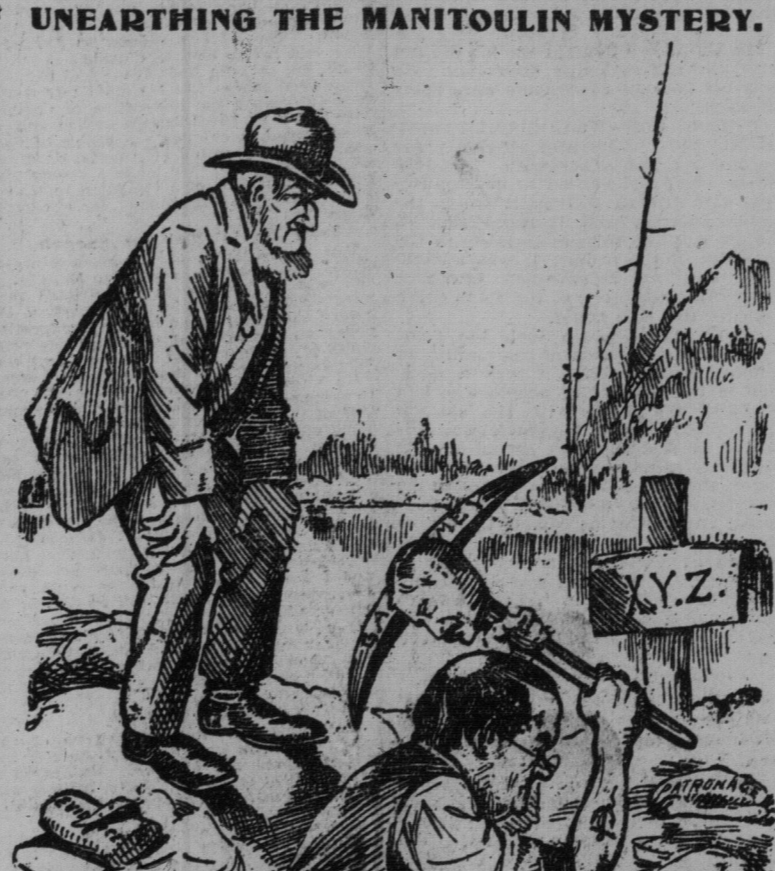
OLD MAN ONTARIO: The government press is mighty critical of the pick your own, Mr. Blake, but all I demand is that you go to the bottom of this thing here.