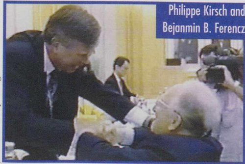
Philippe Kirsch and Benjamin B. Ferencz

The Robert S. Litvack Award was instituted in 1987 in memory of a tireless defender of Aboriginal rights.