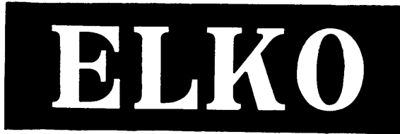
Style no. 1. White letters on blue ground.

As used on the Canadian Pacific & Canadian Northern Railways. Sign 12 ins. high. Letters 9 ins. high. Length according to number of letters in name. The sign shown is 45 ins. long.