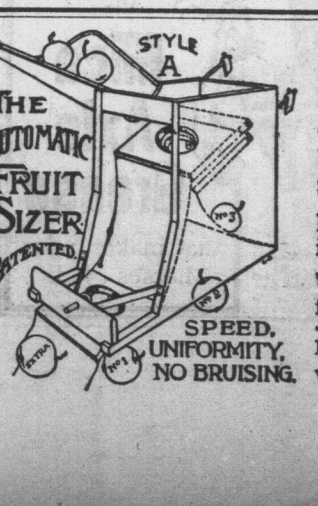
THE AUTOMATIC FRUIT SIZER. SPED, UNIFORMITY, NO BRUISING.