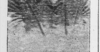
FRANK SABEANS (From photo taken the day following his arrest.)