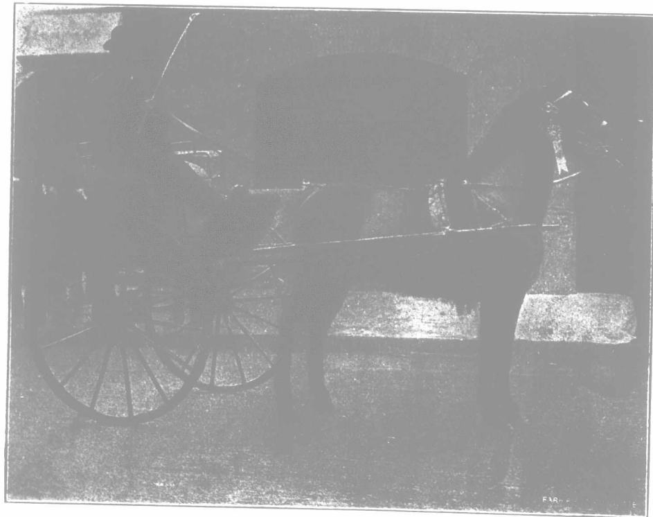
Hackney Stallion, Hillhurst Sensation.

strap the high front foot up to the bellyband; get in the rig and start. Keep him going with the whip as long as he can go, then let down the foot. Start him off again, and as soon as he starts to kick again, strap up the other front foot and keep him going as long as he can. When you let down the foot, he will be very glad to go without kicking. Hitch him up again next morning, and if he starts to kick, go through the same performance as on the preceding day. When he stops kicking, give him a ten-mile drive before you take the harness off him. I have trained