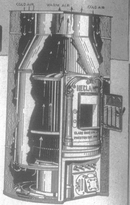
Burns Coal or Wood!