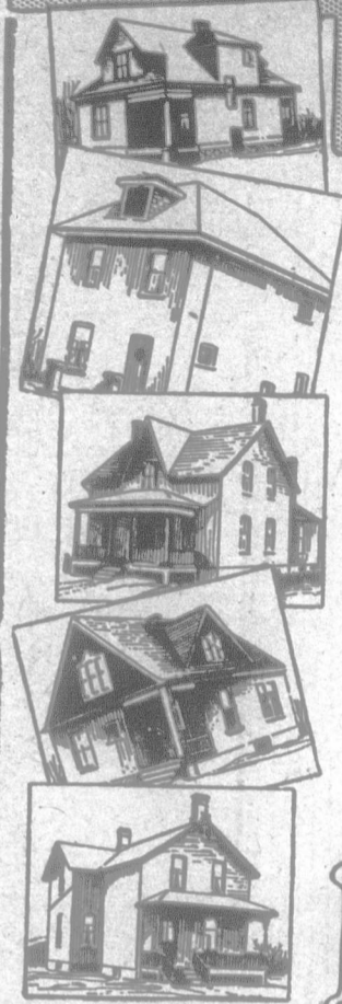
Five typical homes now heated by the "Hecla" Pipeless.

Even if your home is old—even if your cellar is only a small excavation—you can now have a furnace that will heat your home properly—bring winter COMFORT!