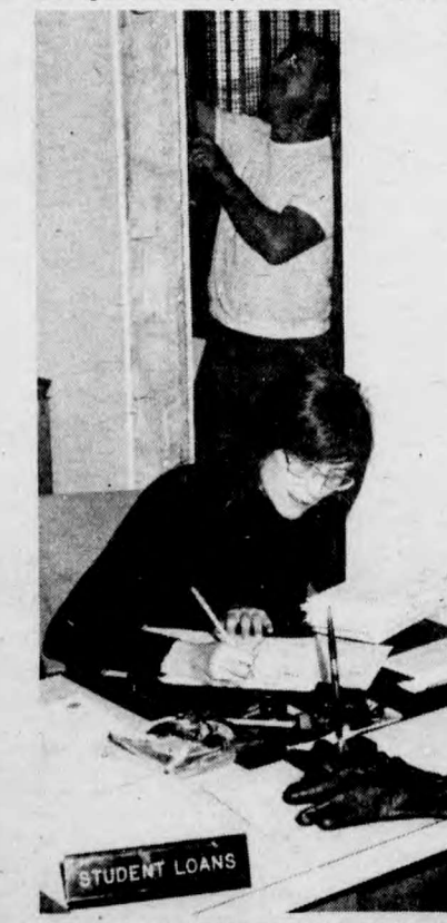
bank employee concentrates during Pizza Pit demolition.

the area previously occupied by the Pit.