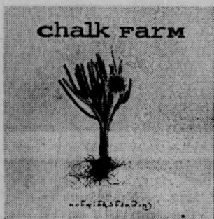
CHALK FARM NOTWITHSTANDING

This album is similar in many ways to dear ol' Hootie. It is better of course, but it has many similar catches. The album itself flies around a lot, but it's cool. The band is really good, and the songs on the album are all consistent, as well as different. This is a great album for studying.