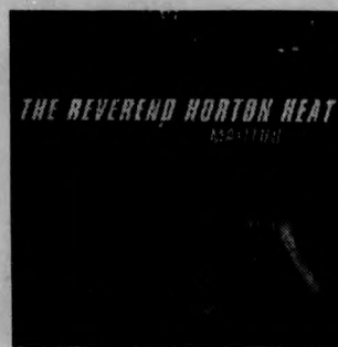
THE REVEREND HORTON HEAT IT'S MARTINI TIME

This album plays like Dr. Jeckyll and Mr. Hyde. For the most part, it is very good, sounding like a mix between country and punk (punkabilly perhaps?). This Dr. Jeckyll portion includes tracks such as "Big Red Rocket of Love", "Slingshot", and "Time to Pray". In the middle of the album, however, Mr. Hyde rears his ugly head and creates humorous, but musically boring tracks which include "Crooked Cigarette," "Rock the Joint," and "Cowboy Love." Fortunately, the Reverend is able to exorcise these demons before they drag his album into Hades, and the album finishes off with a string of catchy tunes, including the best track on the album, "Slingshot." While not perfect, It's Martini Time is definitely worth giving a listen to.