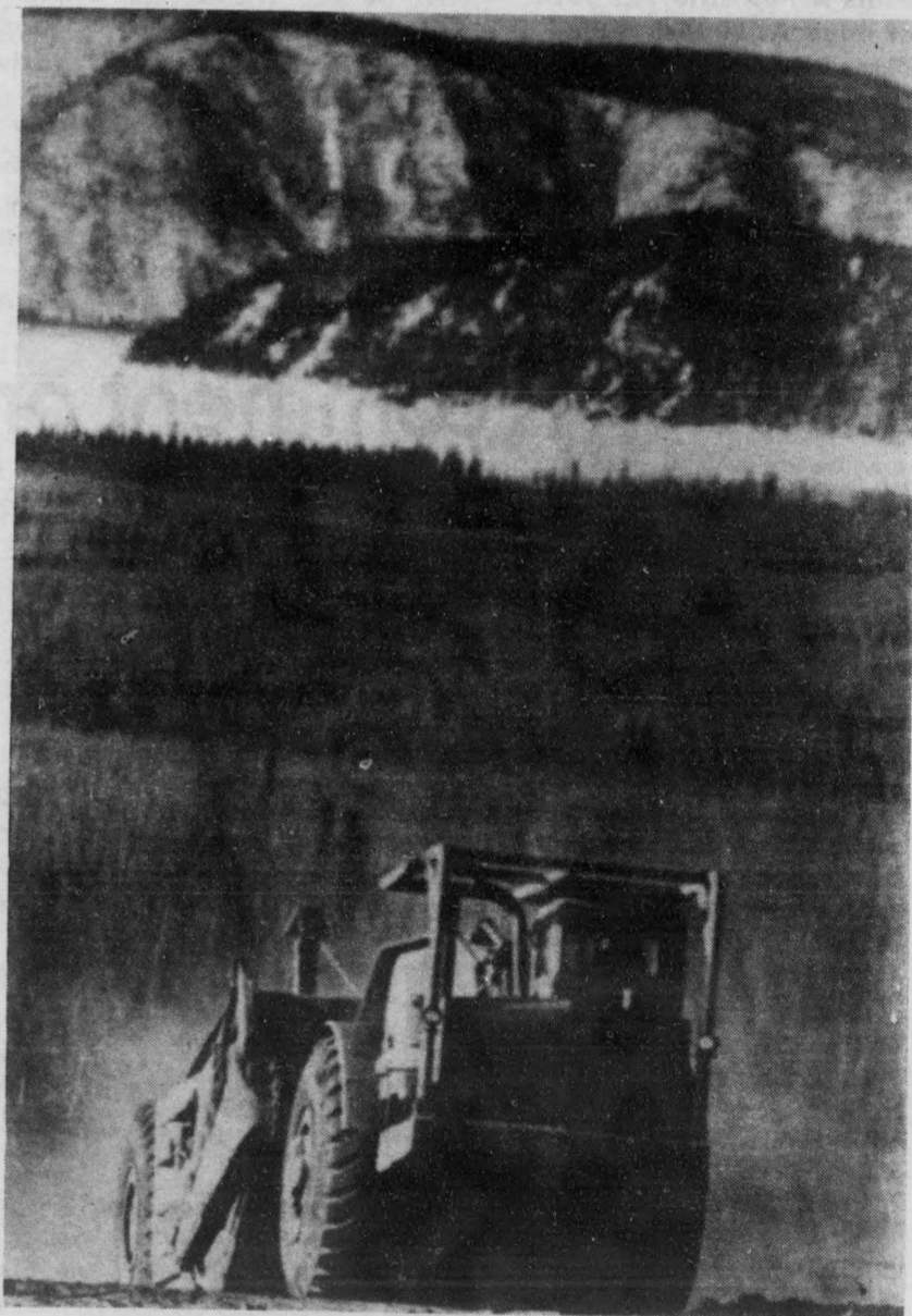
The start of the construction on a 360 mile road above the Frozen Yukon River.