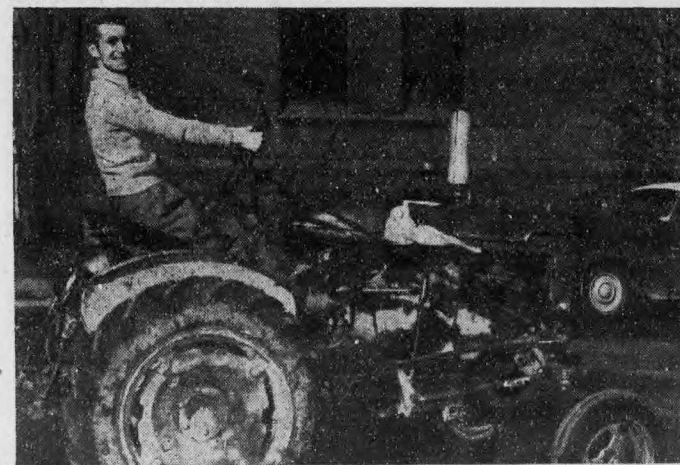
. . . Unidentified type pushes it out

One of the more adroit Forestry professors was very disappointed that the display did not consist of a wider range of models. He commented on the apparent lack of the Farm Equipment Companies to provide the Foresters with suitable machinery to tear down the superfluous parts of the Campus and leave the Noble Few to their noble works.