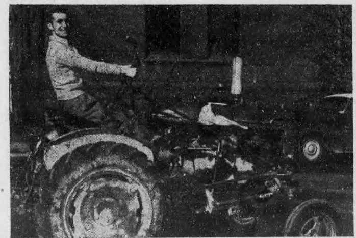
.... Unidentified type pushes it out

One of the more adroit Forestry professors was very disappointed that the display did not consist of a wider range of models. He commented on the apparent lack of the Farm Equipment Companies to provide the Forestry with the first professors was very disappointed that the display did not consist of a wider range of models. Expenditures: | Treasurer. The final vote will be taken on it tonight at the SRC meeting in room 106 of the Forestry Building at 7.30 p.m. Companies to provide the Foresters with suitable machinery to tear down the superfluous parts of the Campus and leave the Budgets: Noble Few to their noble works.