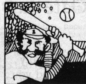
Answers to sports quiz