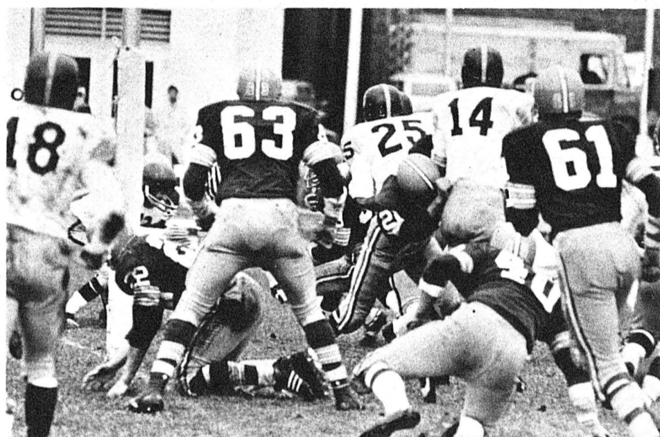
THE BISONS DIG IN (LEFT) AND THE BEARS ARE STOPPED (RIGHT). THIS IS THE DEFENCE THE BEARS MUST BEAT SATURDAY

The Golden Bears left last night for an engagement in the new Pan-Am Stadium in Winnipeg. They'll take on the U of M Bisons tomorrow afternoon at 2 p.m.