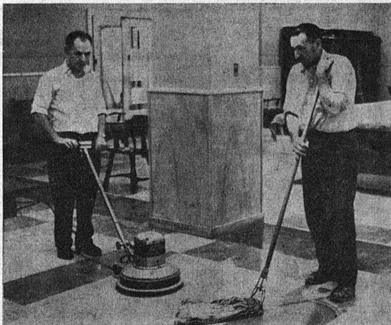
Another scene of SUB after hours. The janitorial staff at work cleaning up after the day's quota of students have trekked mud through the halls and lounges of the Students' Union building.