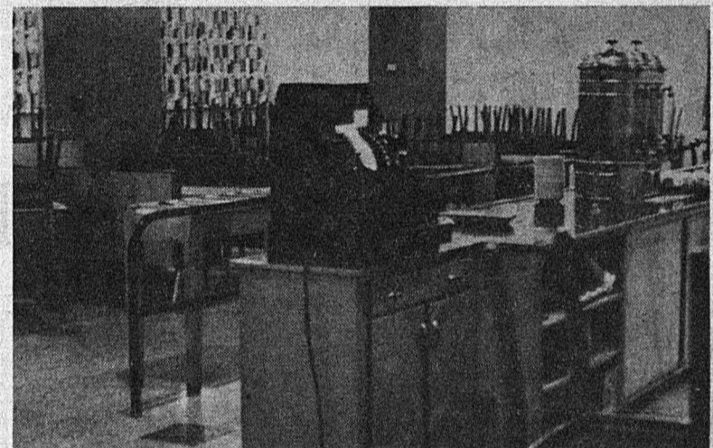
. . . by night, nothing is heard and only the rows of stacked tables and chairs greet the viewer's eye. An aspect of the Students' Union cafeteria which is only seen by the SUB night-owlers, and the janitorial staff.