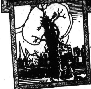
80 stumps in 100 minutes. Record made by Kirstin Horse Power Puller under official test at the Land Clearing Demonstration of the University of Wisconsin.