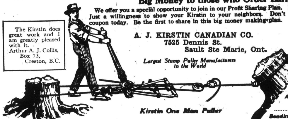
Kirstin One Man Puller